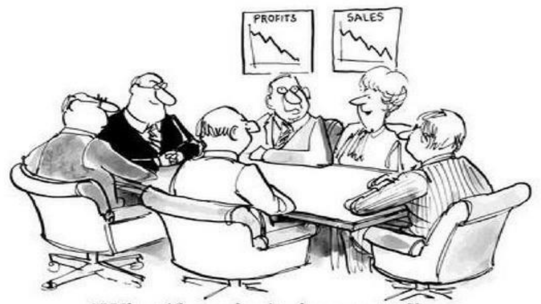
"What if we don't change at all ... and something magical just happens?"